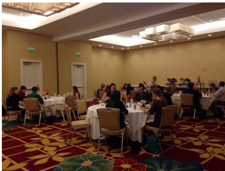
FLASTA Luncheon Attendees